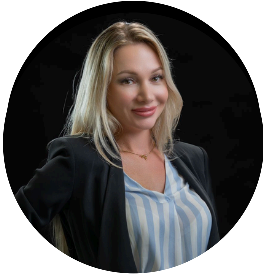
ALLA REAL ESTATE SALES AGENT